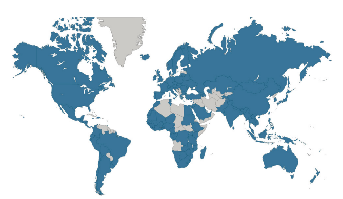
Countries With NIAID-Funded Activities, FY 2021 (n = 136)

In fiscal year (FY) 2021, NIAID supported research activities in 136 countries. Total NIAID international research funding was $718.2 million.