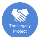
The Legacy Project