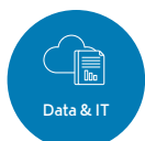
Data & IT